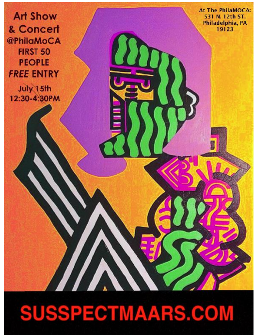
Poster for the Event