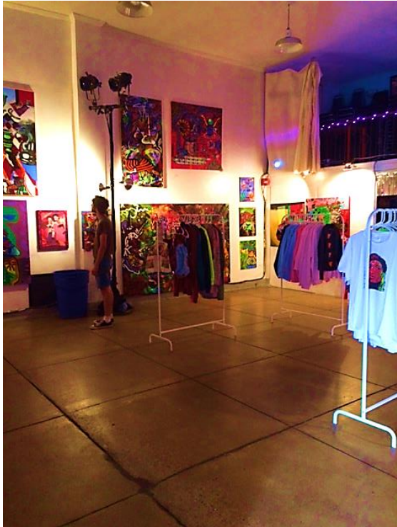
This was the Clothing and Painting Portion