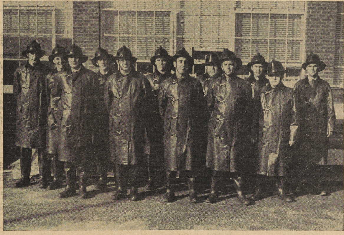
Members of Superior Fire Brigade Line Up for Inspection