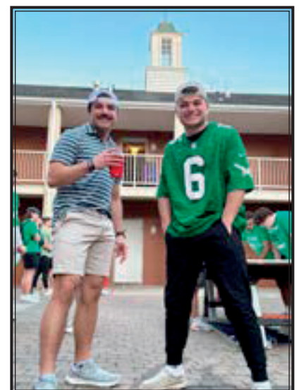
Beer Die Captains hydrating pre-game.