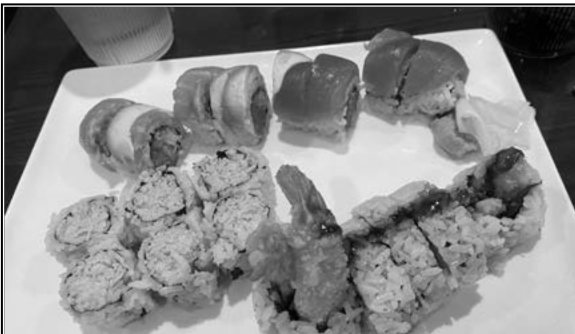
3 Rolls Combo: Pink Lady Roll, Shrimp Tempura Roll, and Spicy Crabmeat Roll

It's a good thing to know as a college student that there is a solid sushi spot near campus that has reasonable prices and a reason to keep going back. One thing I think this place can improve upon is the quality of their rice. Whether it's preparing it or depending where they get it from, bettering it may make a significant difference in taste and texture. But altogether, I suggest you get away from campus for an evening and grab your friends to go check it out for yourself!